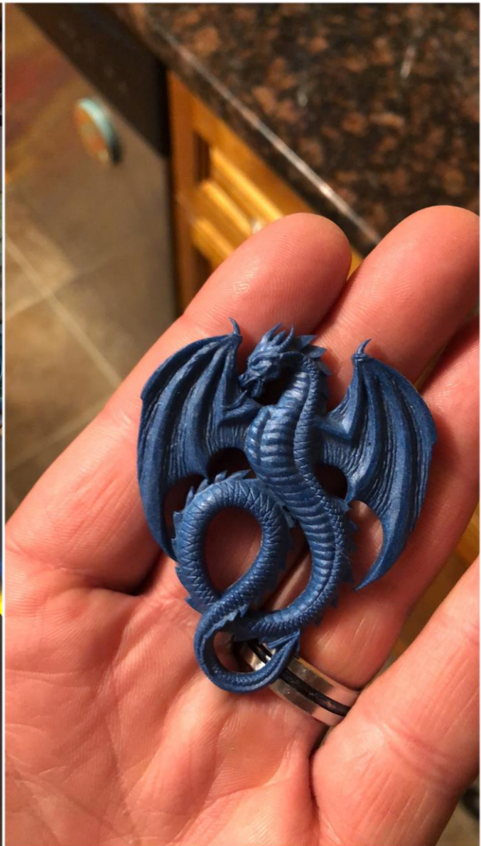
Ben Nieves shows some of his turned rings and cast epoxy magnets Top left ring is Blue Opal crushed stone inlay in stainless steel core