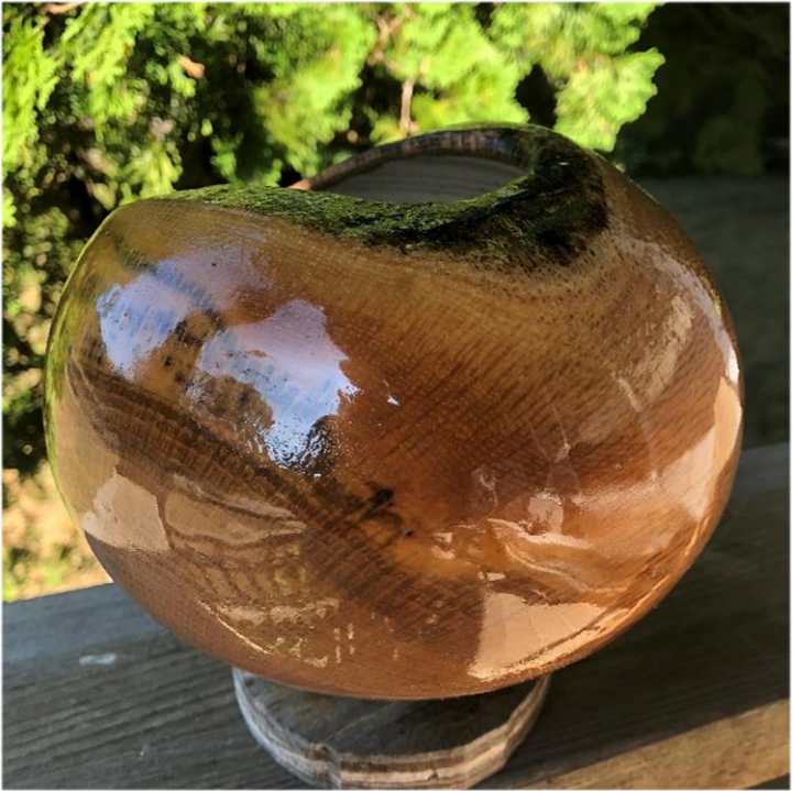
Roland's Green Oak with 1 to 1 epoxy and acetone