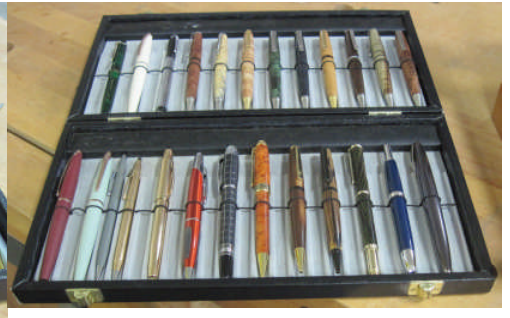
Angelo Iafrate also showed a collection of store bought and “home” made pens as well as a multi-axis Kaleidoscope, a series of natural edge bowls, and an “Escoulen styled” scoop and box set