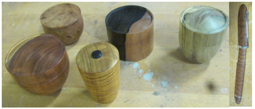
Angelo Iafrate brought in many items to show – a set of small boxes and a triangular pen