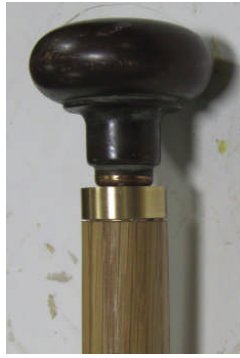
Vin DiFrenna – 2 canes for vets. Made using a White Oak shaft and fastening a doorknob*** for a handle.