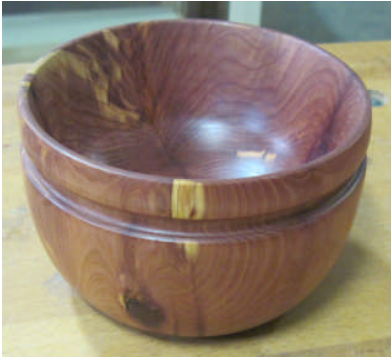
Lorraine Hilton - a Cedar bowl finished with wipe on poly and used epoxy to seal cracks. 1 coat Tung oil and 2 coats wipe on poly.

{***- the doorknob needs a square shaft to mount on. Suggestions were made to try Glade wrecking in Woonsocket and National wrecking in ??? “Old” door knob shafts are expensive at antique shops and hard to find at junk shops}.