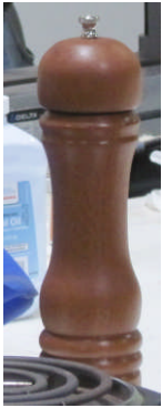
Craig Verrastro – Mahogany peppermill*