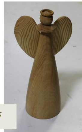
Turned angel with heart-shaped wings