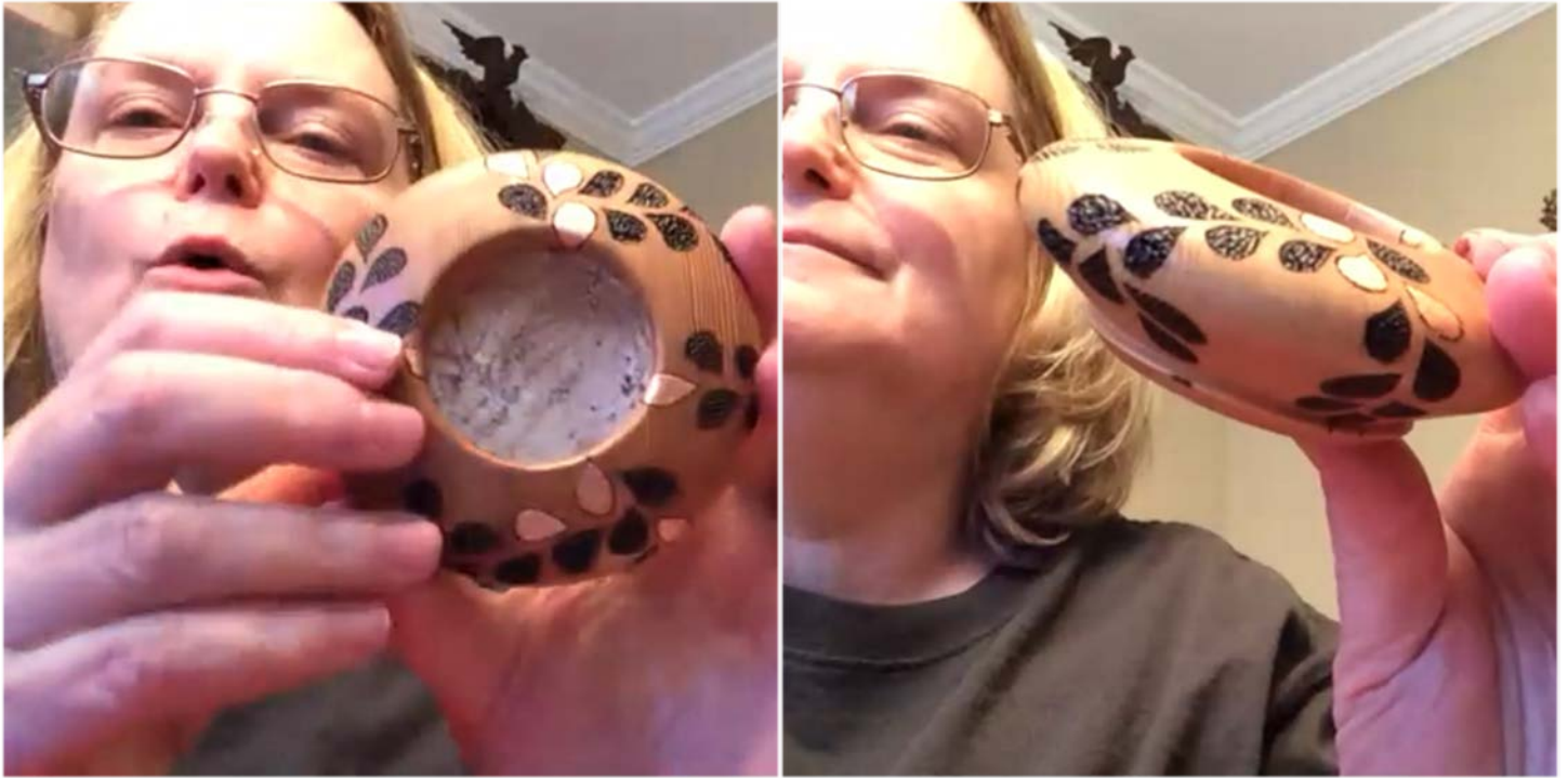
Visiting club member showing her 1" x 3.5" piece with copper leaf and pyrography