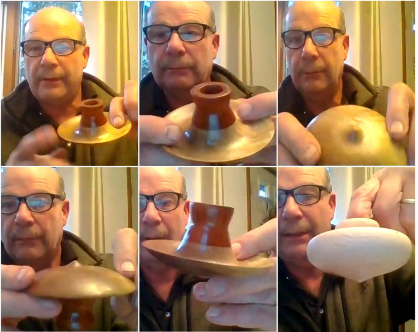
Ian showing 2 of his Tops, the second is Maple with more Mass for greater angular momentum allowing it to spin longer.