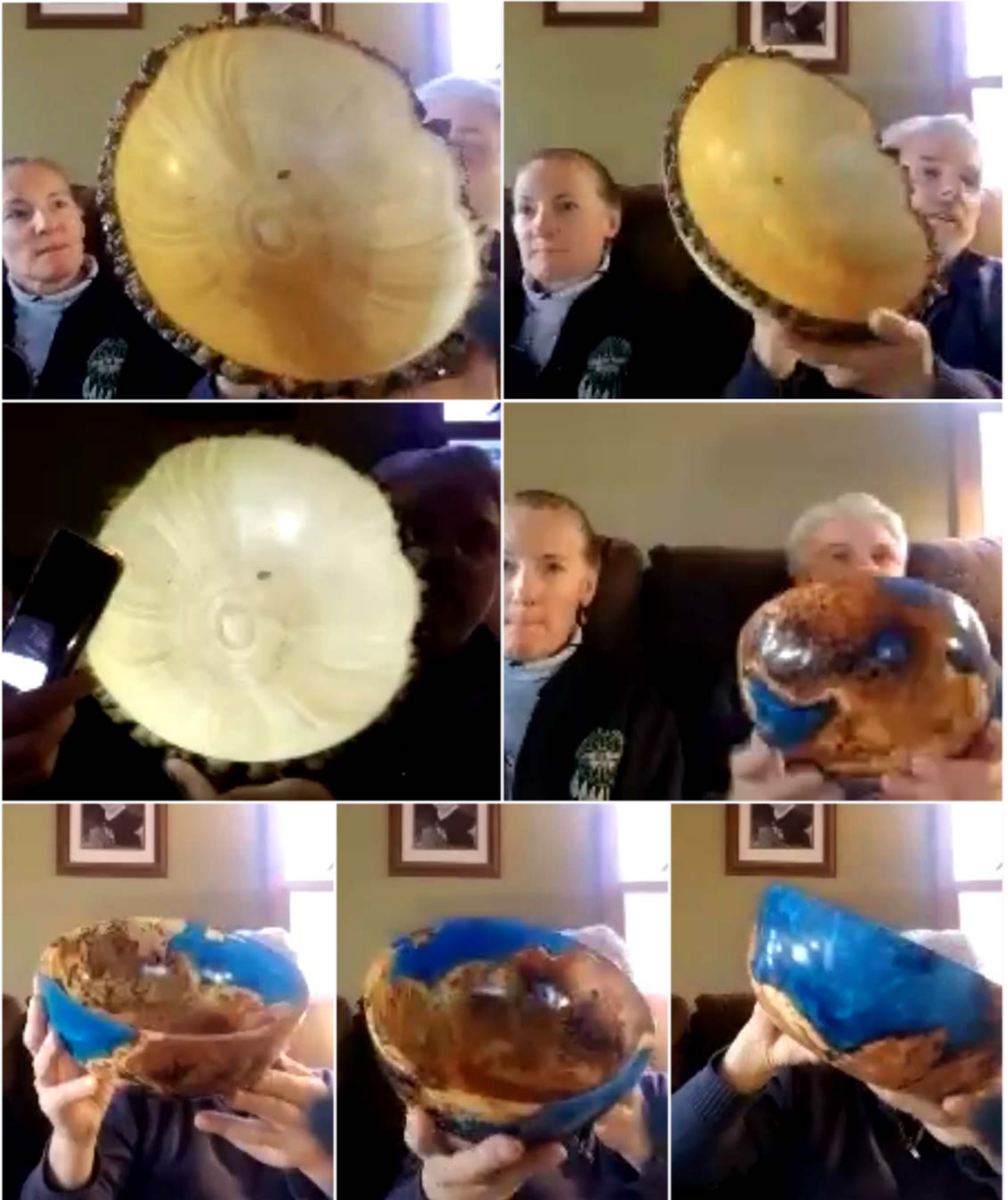
2 visiting club members showing a Live Edge Oak Burl Bowl and Maple Burl Hybrid Bowl