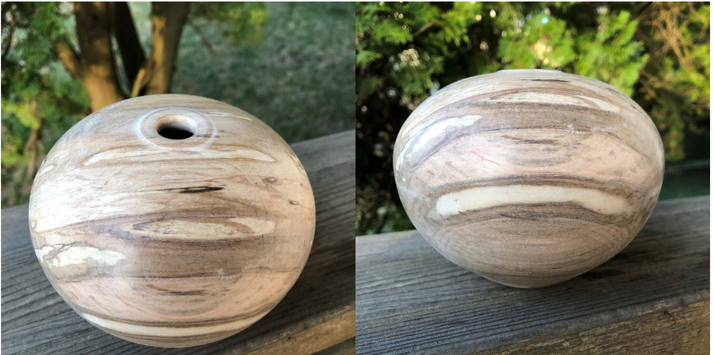
Roland Lavoie Multiple Hollow Forms