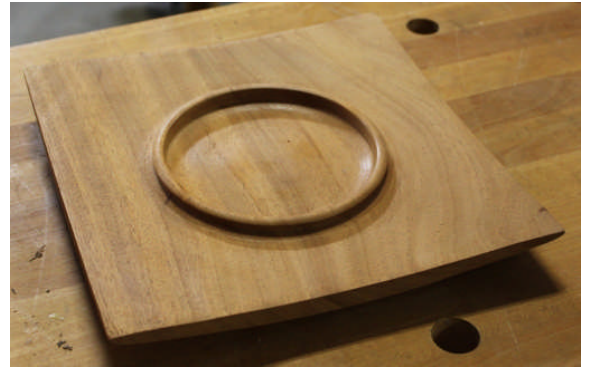
Chuck Petitbon – showed an Oak ornament made with inside-out turning technique and a square dish made from found wood