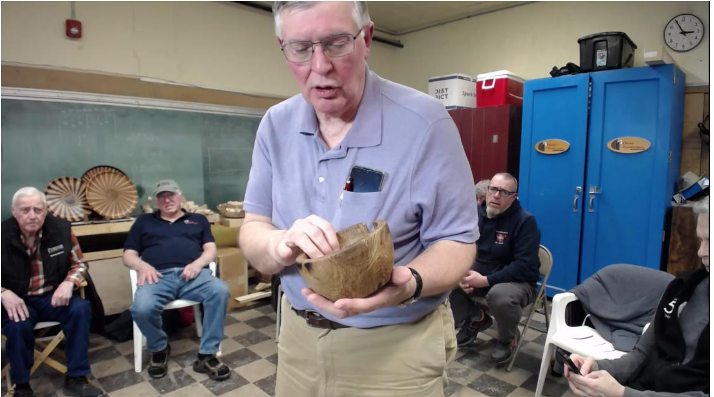
Kurt Driftwood Bowl