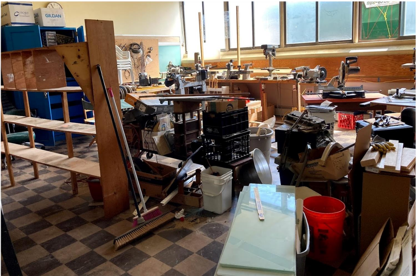
Ocean Woodturners - 2021